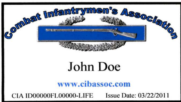
Front of Valid Membership Card (DOES NOT read 'Support Group Member')