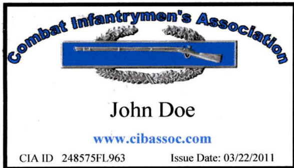
Front of Valid Membership Card (NO 'S' at the end of CIA ID number)