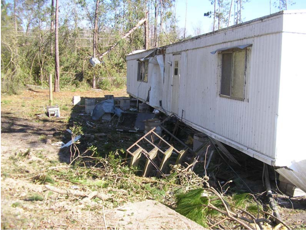
This photo and the next two are of a 1980s vintage home that was uplifted from its original location and thrown against a large oak tree.