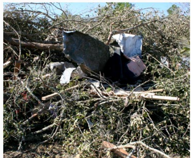
Trees, furniture, clothing, pieces of appliances and torn metal are piled in the Vercher yard, waiting to be taken to the landfill.