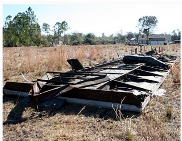
The upside-down base of the Vercher home lies in a nearby lot.