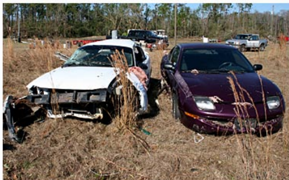
Two cars, smashed by the storm, await removal.