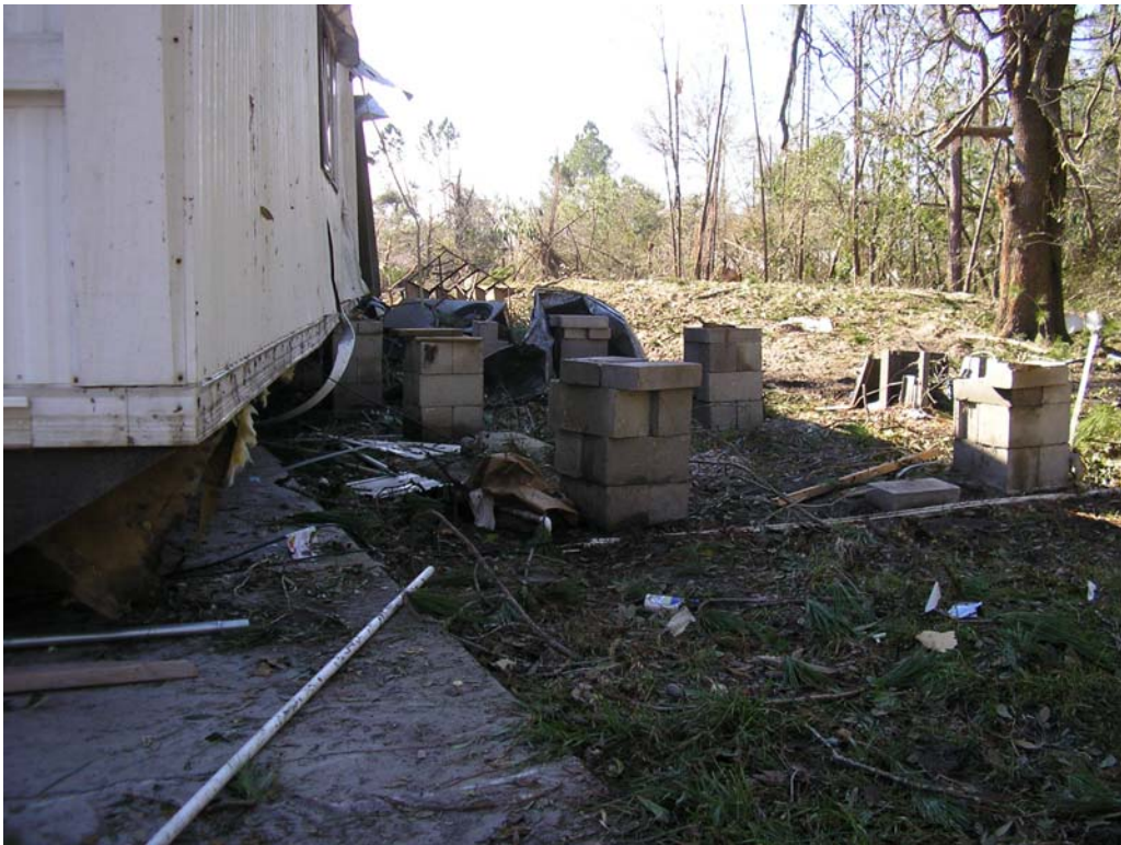
This was the original location of this home.