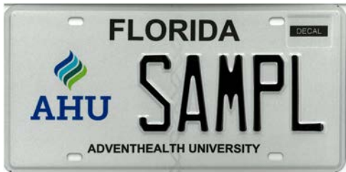
ADR, ADP, ADA