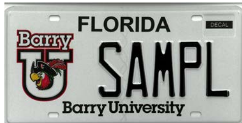
BUR, BUP, BUA