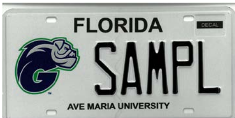
AVR, AVP, AVA