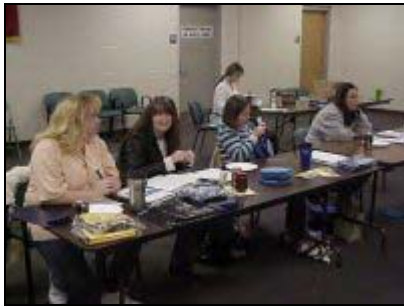
FHP members attend class.