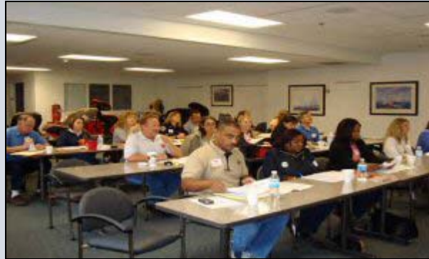
22 Technicians including 4 instructors evaluations demonstrated that the reunion was well received and they want more!