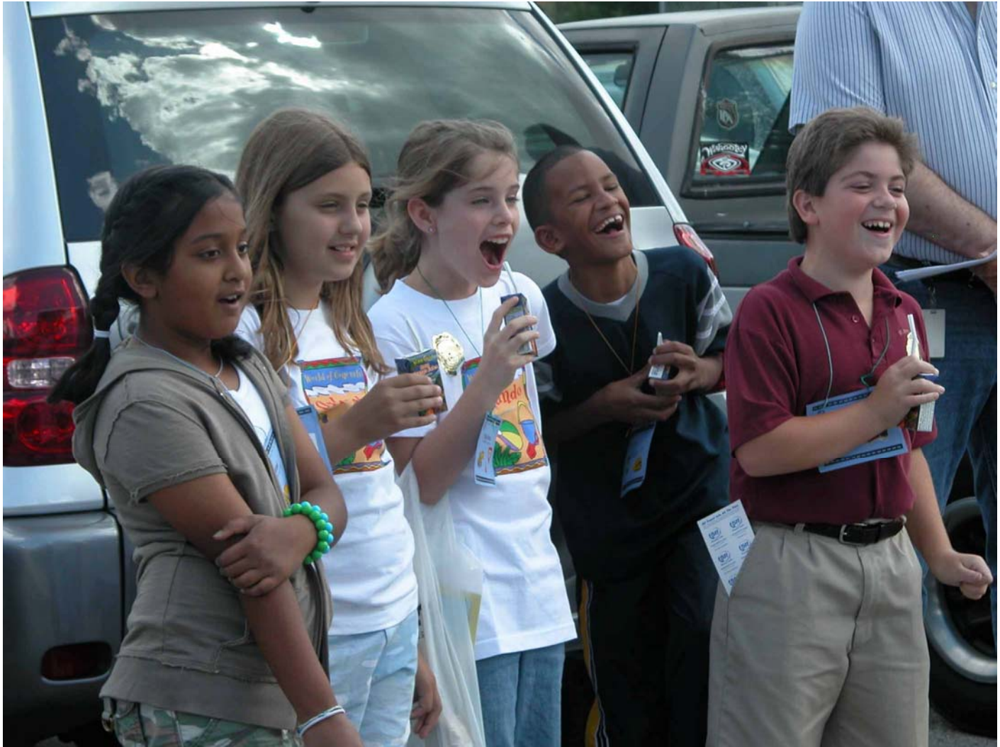
Juice boxes in hand, these “tweens” look on as they witness what happens when kids don’t buckle up in a car. One of FHP’s rollover simulators just demonstrated why kids of all ages must ride restrained every time, every ride, and why booster seats should be used until age 8.