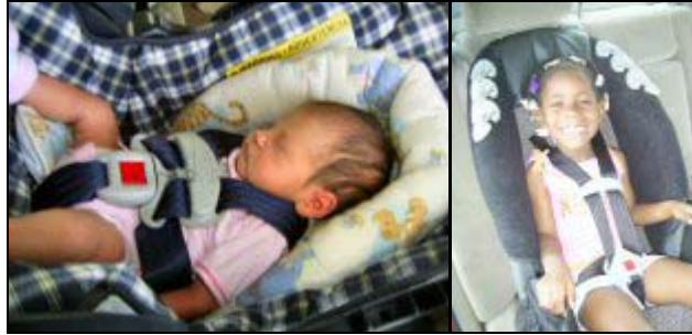
Over 100 children left the event safe and happily buckled up.