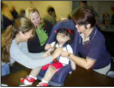
Class members strap in a doll for practice.