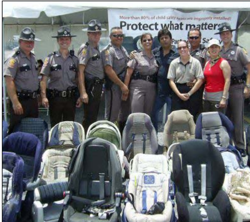
FHP partners with 21st Century Insurance and TV Star Erik Estrada for a special Child Safety Fair at University Mall in Tampa.