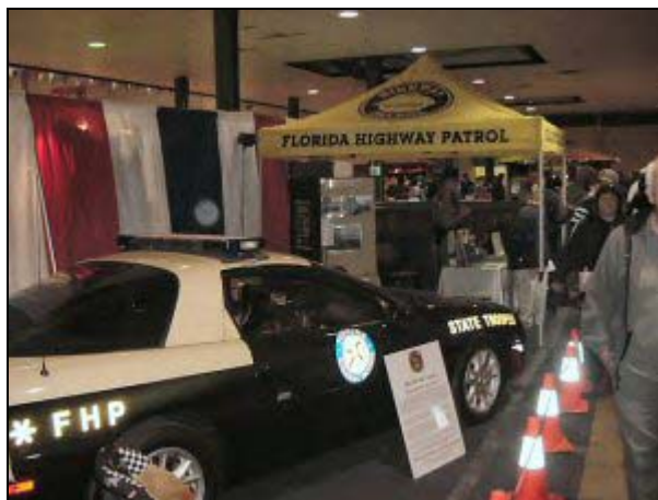
This year's FHP display included a retired Camaro patrol car and an informational booth with safety education materials and give-aways.