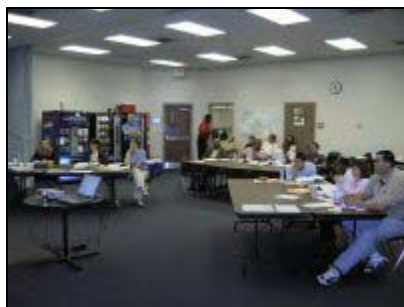
Class members listen attentively.