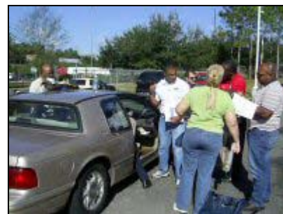
The training course includes outside learning.