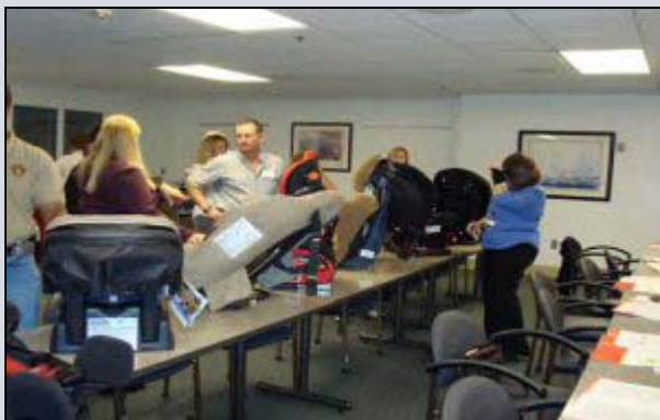
Technicians had an opportunity to check out some of the new seats on the market and learn more about ones that will be available soon.