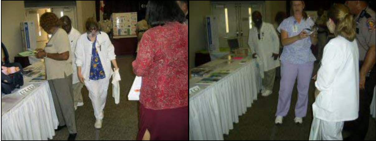
A couple nurses attempt to walk heel-to-toe while wearing Fatal Vision goggles.

driving. Trooper Conya Bassett set up a Child Safety Seat Display and spoke with parents and caregivers about the importance of using the proper child seat and having seats installed properly.